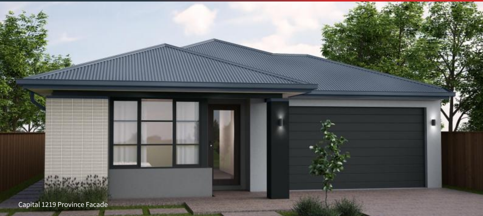
Capital 1219 Province Facade

LOT 104 BUTTERNUT STREET , ACACIA VILLAGE , WOLLERT