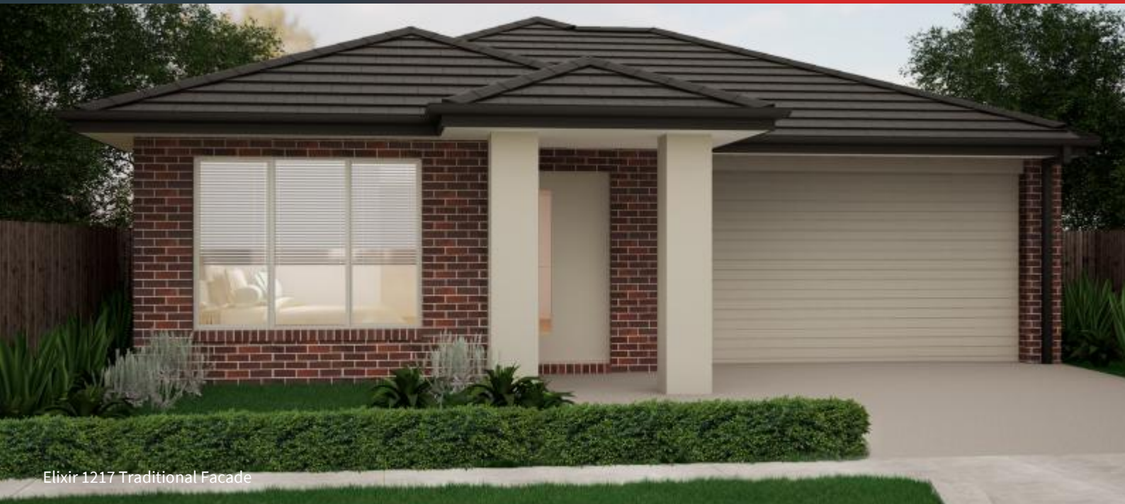
Elixir 1217 Traditional Facade

LOT 331 BUTTERNUT STREET , ACACIA VILLAGE , WOLLERT